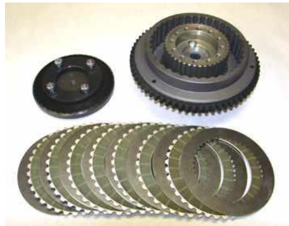
BDL Ball Bearing chain drive assembly

Install clutch basket on to transmission main shaft, install 3-.078" steels in first then alternate fiber, steel and ending with a fiber. (Clutch pack is 8-.078" steels and 6 fibers)