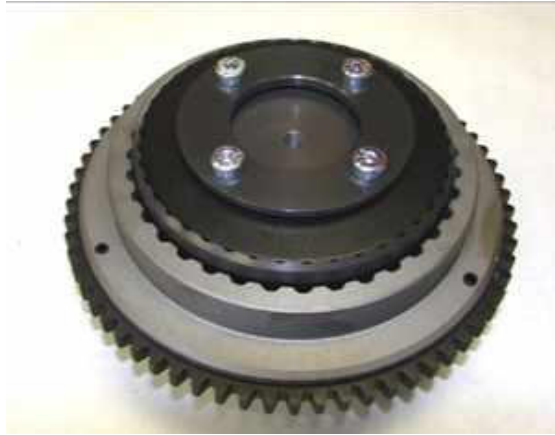
BDL Ball Bearing Clutch Basket Fits 1998 to 2006 Big Twin